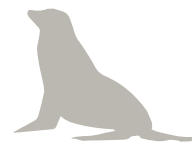
Galapagos sea lion