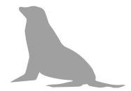
Galapagos sea lion